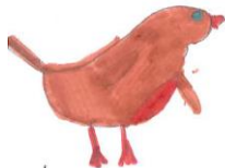
by Grace X5